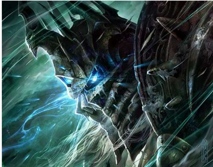
The Helm of Domination, the means to control the undead.

Anduin would end up using the Mallet in a fight with Garrosh and was promptly crushed by the now shattered bell.