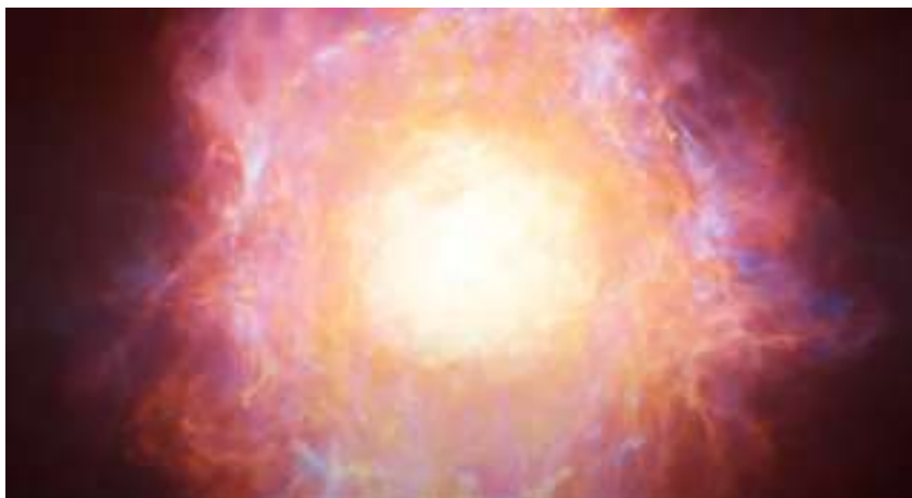
Azeroth's World Soul