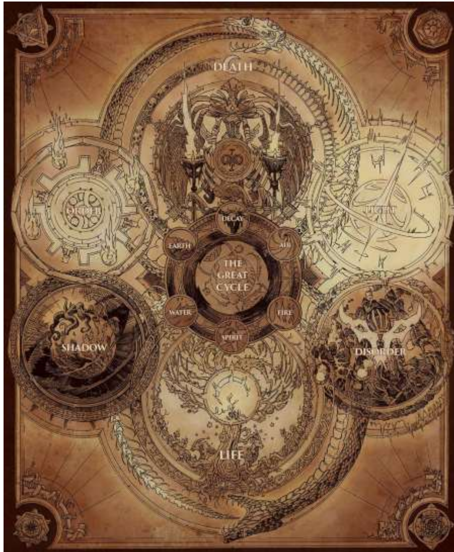
The cosmology of magic as told by the Brokers

If it's a big seam of purple. Bluish crystal, you can probably at least make a few gold on the bet that it's a ley line.