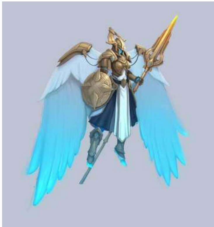
The Kyrian, Ferrier of souls

If you've ever died in world of warcraft and had to take the resurrection debuff, the creature you were talking to was a Kyrian.