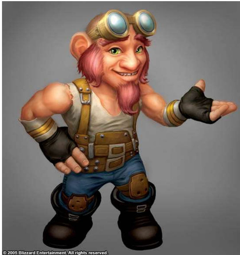
A gnomish engineer, looking very... gnomey?