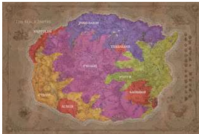
Azeroth Pre-Titan discovery