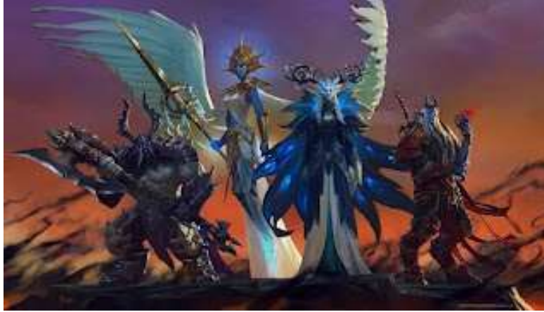
The Pantheon of death at the time the adventurer arrives