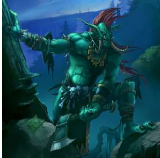
A forest troll looking extra menacing