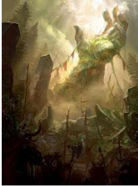
Tyr's revered Silver Hand