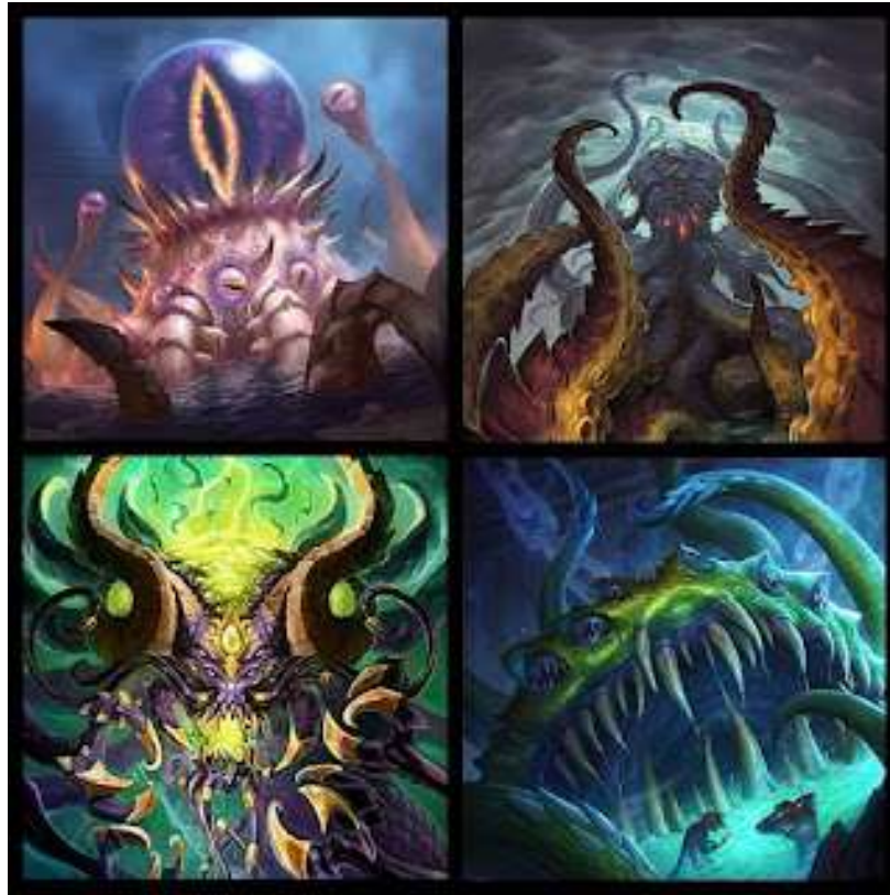
The Old Gods

king, only to swiftly have a sword buried in his head to keep him down. The C'Thraxxi would start to stir again during the third legion invasion, only to have a member of the Valarjar show up and kill it for good this time.