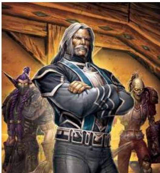
Lord Jorach Ravenholdt leader of this “Assassin’s League”