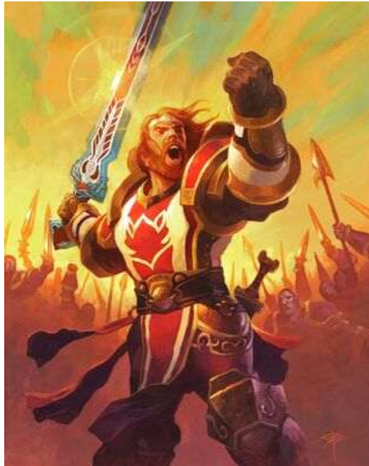
Taelan Fordring, son of Tirion Fordring, fighting for the Scarlet Crusade

It's been stated on several occasions that even if the leadership of the organization is killed, there will always be some new determined crusader to take its place.