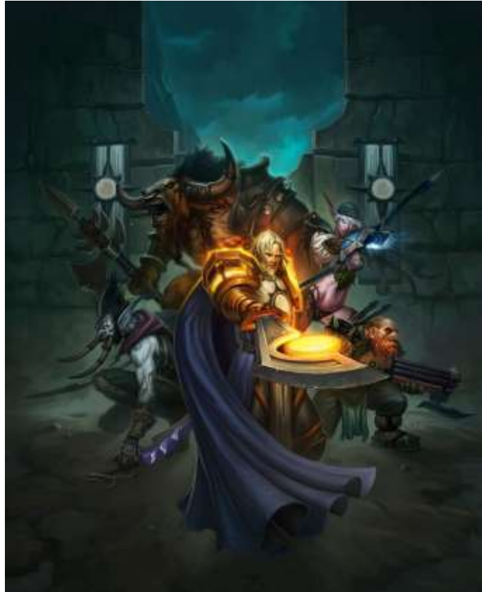
The Argent Crusade combatting the scourge in Northrend