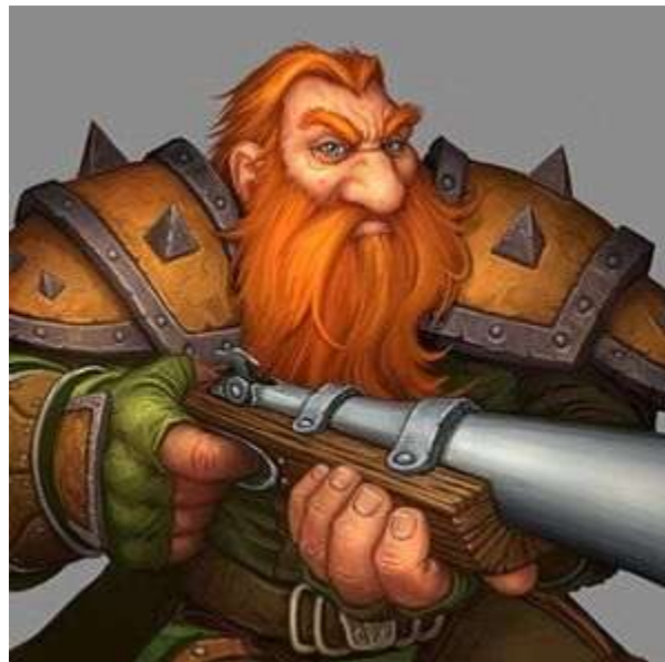
A dwarf's Dwarf.

By the time of Dragonflight he has apparently retired, and his son is now leading up the expedition to hunt big game. (No really that's it, that's as deep as that goes, he's just a really big game hunter).