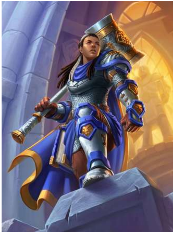
The Archetypical Human Paladin.

He would be among the forces landing in Khaz Algar to help combat the Nerubians and coming troubles.