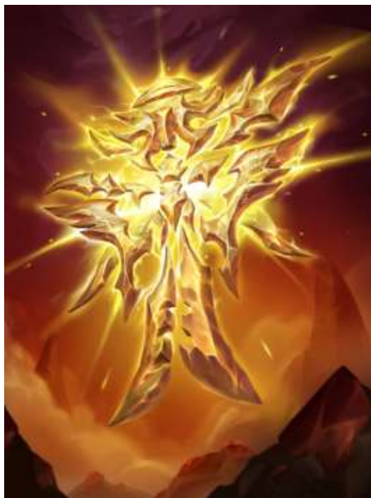
One of those holy crstyal chandaliers