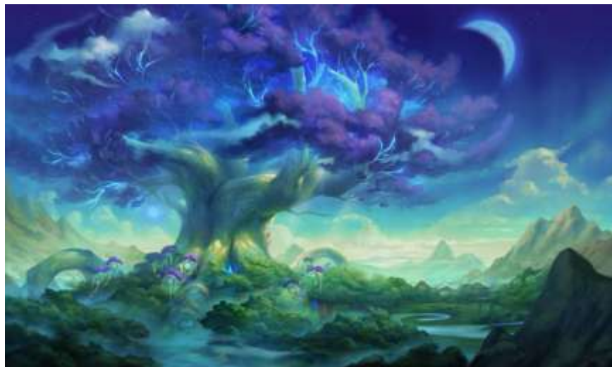
The world Tree Amirdrassil

*Side Note: The various connections to the emerald dream spotted throughout the land (Ashenvale, Duskwood, The Hinterlands, Feralas and Crystalsong Forest (though the one in Crystalsong lacks a portal)) are considered "Great Trees" rather than world trees despite also just being branches of Nordrassil that Fandral had gone about planting.