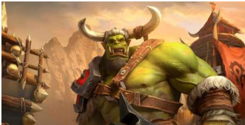
An Orc being orcy as hell. Just look at him.

His ability to fight was so renowned, that the traditionally xenophobic Kaldorei were like “this dude’s cool”. It was here during this war that Malfurion would make him an axe under the direction of Cenarius himself. During the battle of the Well of Eternity he fell THROUGH the portal and ended up on Argus. There he just went ham, killing countless demons, so much so that it drew the Attention of Sargeras himself. And during their battle, Broxigar actually injured him enough to distract him and allow the Kaldorei to seal the portal. Now, Sargeras did kill him for this but his legacy lives on being the only orc the night elves made a STATUE of.