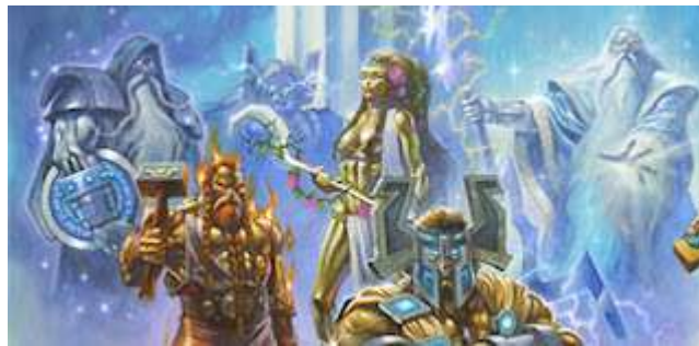
The Pantheon of Titans bringing "order" to the cosmos