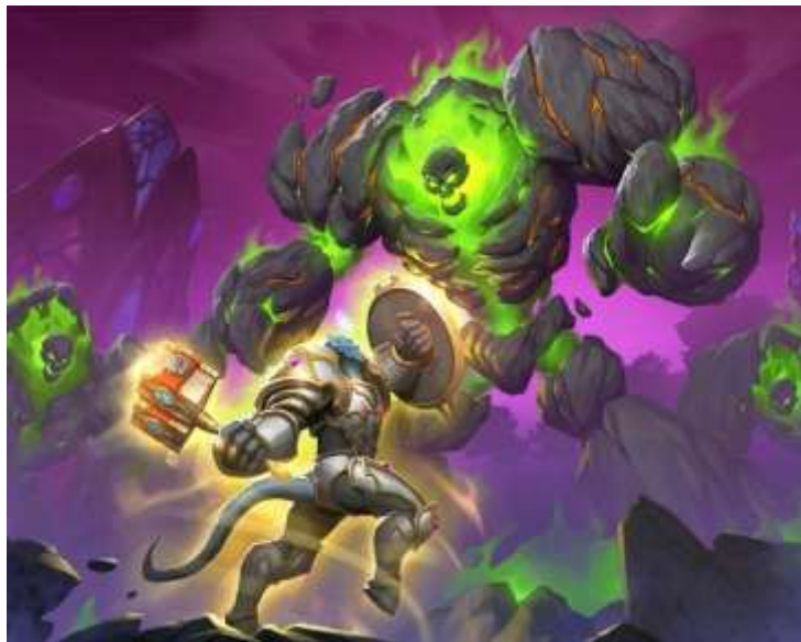
A Draenei Vindicator and Three infernal walk into a bar

Ur'zul – This is also legally speaking, an Eredar, several of them in fact, horrifically fused together.