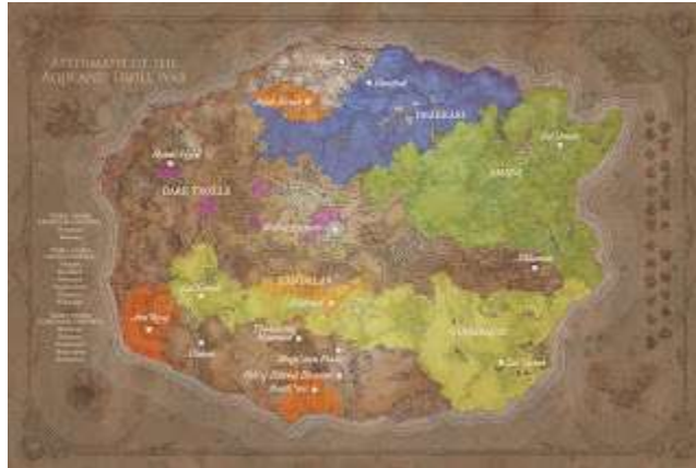
Same Shape, now with trolls and bug remnants

gods) and building cities on top of them including Zul'Aman and Atul'Aman. This is collectively known as the Aqir and Troll War.