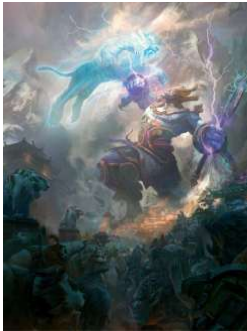
Xuen and Lei Shen's fight in the Kun Lai Summit.

*Though a fun little bit of speculation (On the part of Brann Bronzebeard) is that Niuzao is the wild god who created the Yaungol (you know the tribe of hoofed, horned critters living around his temple) and then the Yaungol are of course the progenitors of the Tauren and Taunka.