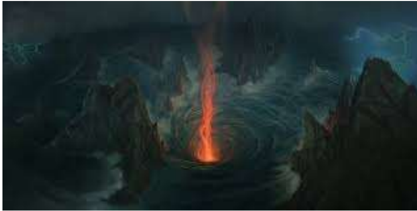
Azeroth's most famous Landmark, the Maelstrom

elemental planes would be forced into the physical realm causing untold amounts of damage and thus the cataclysm.