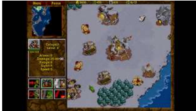
Warcraft 2: A lot happens