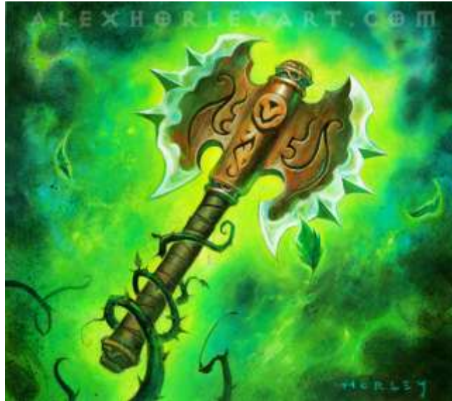
Broxigar's super cool axe