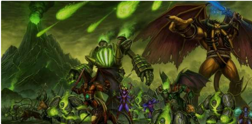
A horde of demons led by Kazzak

Magtheridon – Taking over the outlands by riding back on one of Ner'zhul's many portals, the demon set himself up in the black temple and then started enslaving the remaining orc population, forcing them to drink his blood. When Illidan and team rolled up, he was quickly usurped of his throne and put into chains at the bottom of the hellfire citadel where adventurers would find and swiftly kill him.