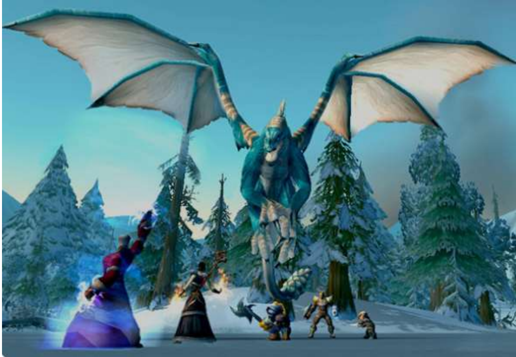
Big flying lizard I tell you what