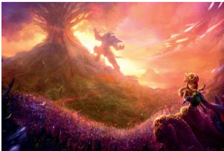
The final moments of the Battle of Mount Hyjal