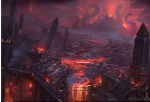
The Black Empire in its prime