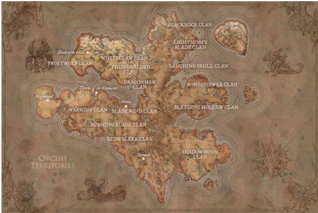
The various original Orc Clans spread across Draenor