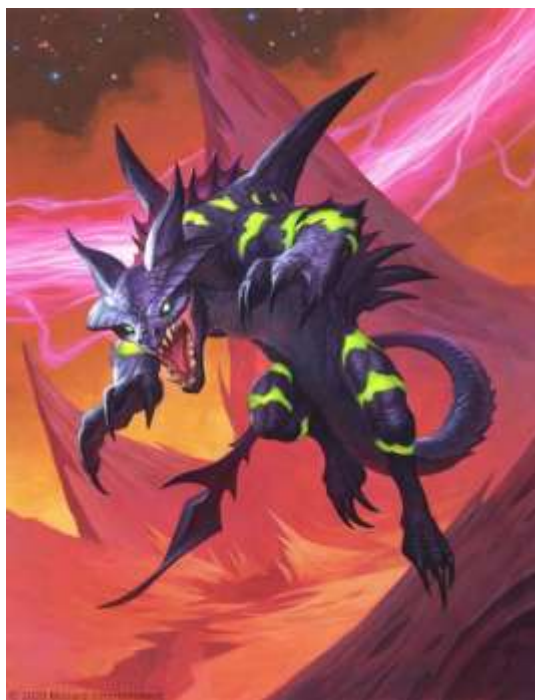
A warp stalker pounces upon it's prey.

Warp Stalker – A large lizard like creature that was native to Draenor, that upon the planet's corruption by the burning legion, learned to teleport and phase in and out of the Astral dimension on a whim. These blink Lizards are often used by the burning legion as mounts.