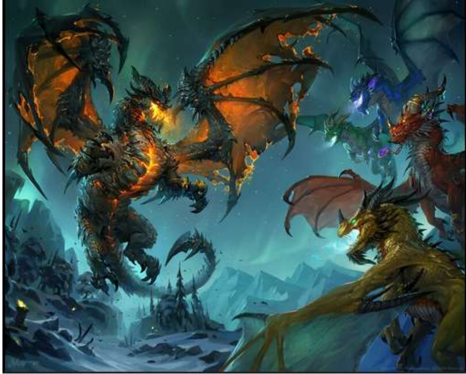
The 5 Aspects