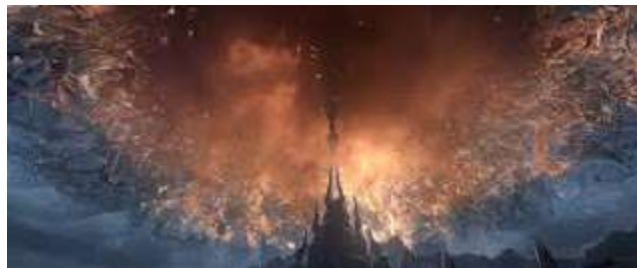
The barrier between reality and the shadowlands.

Major Deaths: Zovaal, Kel'Thuzad (for real this time)