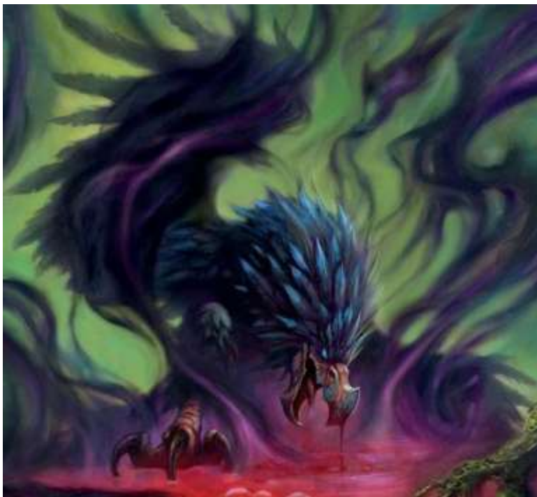
Anzu taking the world's worst bath in Sethe's blood.

light and in honor of Anzu they would learn mastery of the Arcane, eventually Rukhmar would grow old and die, leaving the Arakkoa to flourish and build the Apexis empire in her wake.