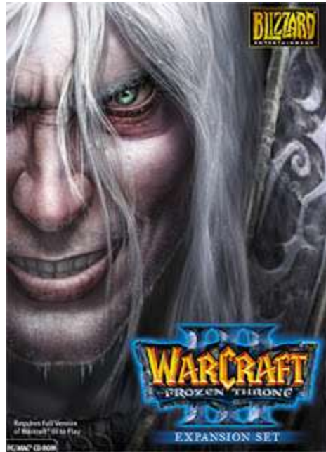
Warcraft 3 - The Frozen Throne