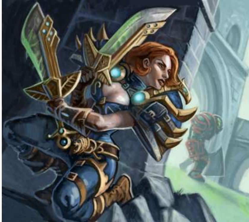
A member of SI:7 preparing to do well... spy things