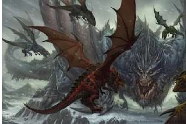
The fight between Galakrond and the Future aspects