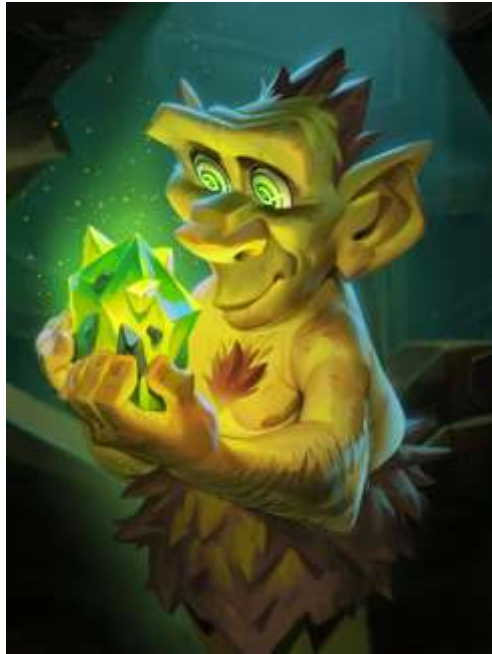
A protogoblin holding Kaja'mite (according to Hearthstone)

*Note: Given their name sake and the behavior of other pockets of blood, Sargerite and Argunite are probably the crystalized blood of Sargeras and Argus respectively.