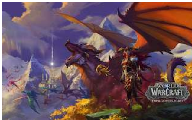
The Lizard Capital of the world.