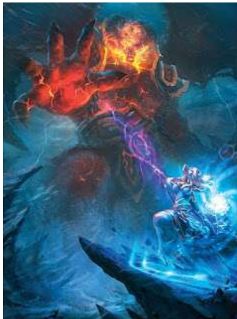
Demons and Magic, always a problem