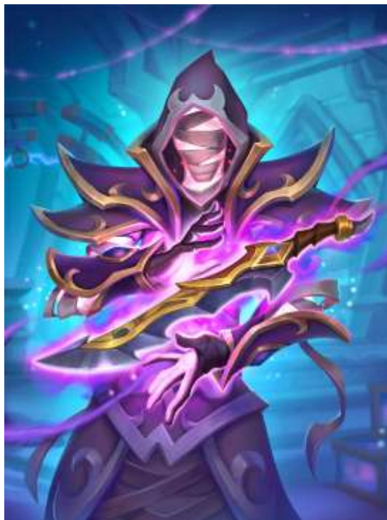
An Ethereal transmuting a weapon

beyond the fact that he seems to view Alleria and the Ren'dorei a bit like students and that he at least seems like he's working against the interest of Xal'atath and the rest of the Shadowguard.