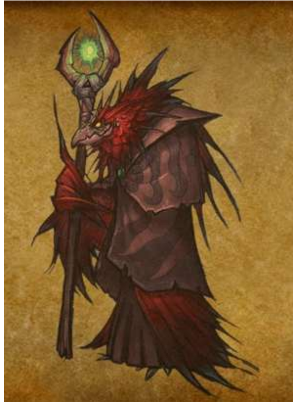
A once proud avian people.

By the time of the Burning crusade, as time ate away, what remained of Terokk's followers fell further and further from their once great king, now committing horrible acts of evil, and leaving only fragments calling themselves the Skettis Exiles would align themselves with the remnants of the Draenei and some adventurers to summon Terokk from the realm of shadow and put him down for good.