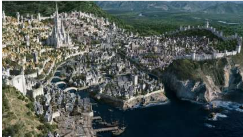
Stormwind City from the Warcraft Movie