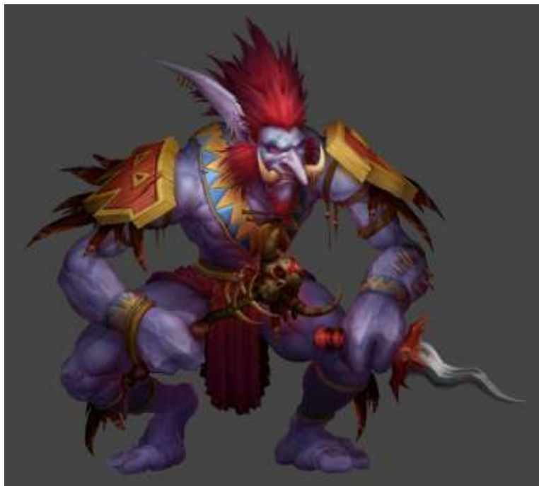
The classic Warcraft troll.

Zen'Kiki – A novice druid of the Cenarion circle who probably isn't that important in the scheme of things, but you can find him learning to be a druid in the Plaguelands, representing the Darkspear trolls starting to integrate with the Circle. He's a personal favorite of mine for his antics and you should go do his silly quests.