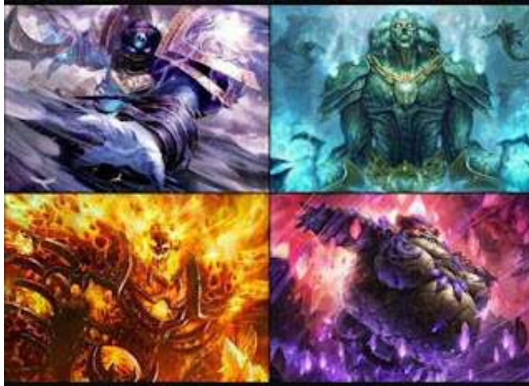
The original elemental lords