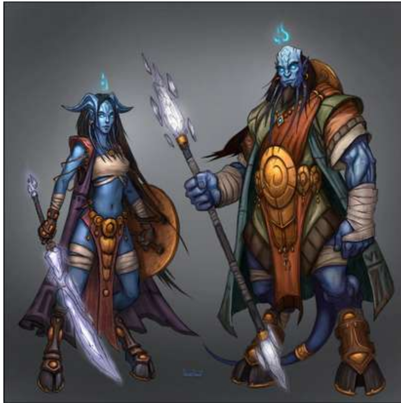
Early Draenei Concept Art

He would go on to assist in various spots throughout the campaign to take the Iron Horde intending to deal vengeance to the warlords who had destroyed his people, before being killed in a battle aboard Blackhand's warship in the defense of Shattrath.