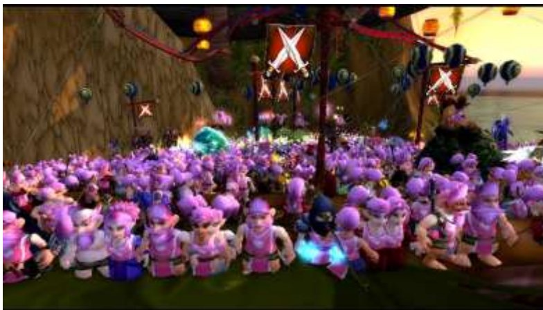
A screenshot of the Running of the Gnomes 2017

Wanderer's Festival – Happening every Sunday on the beaches of the Krasarang wilds, this is in honor of the great moving island and turtle Shen-zin Su and the Pandaren credited with discovering him, Liu Lang. those partaking light a lantern and place it in the water.