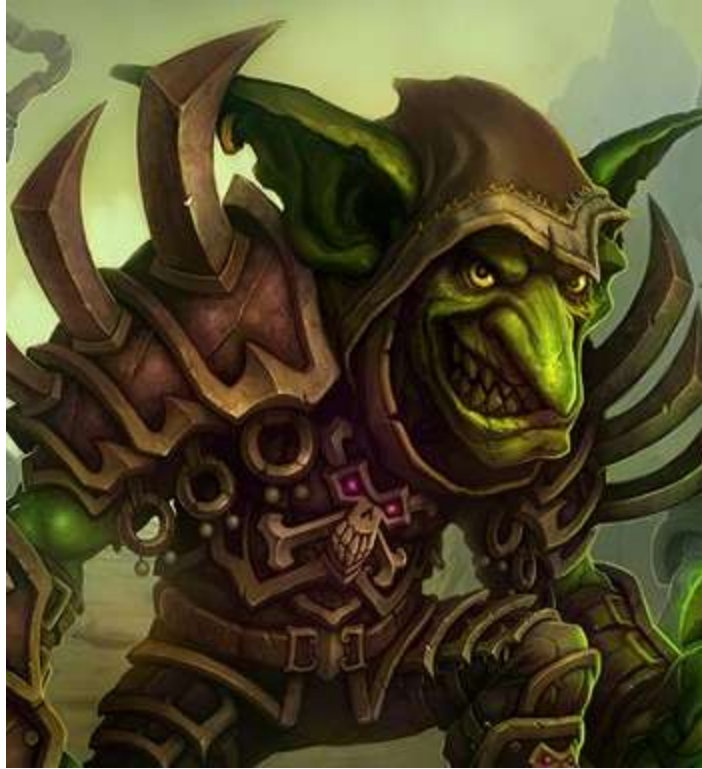
A goblin rogue, being very sneaky