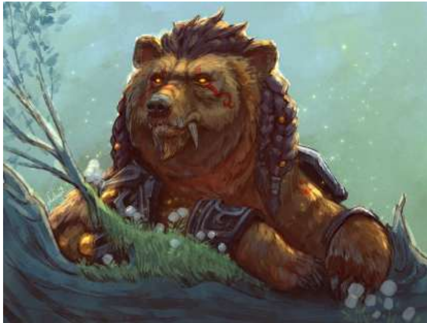
The wild god Ursoc looking handsome

In more recent times, she managed to get herself abducted by a group of primalist that had aligned themselves with the Nokhud clan centaur forcing her to perform various acts on their behalf before being freed by traveling adventurers.