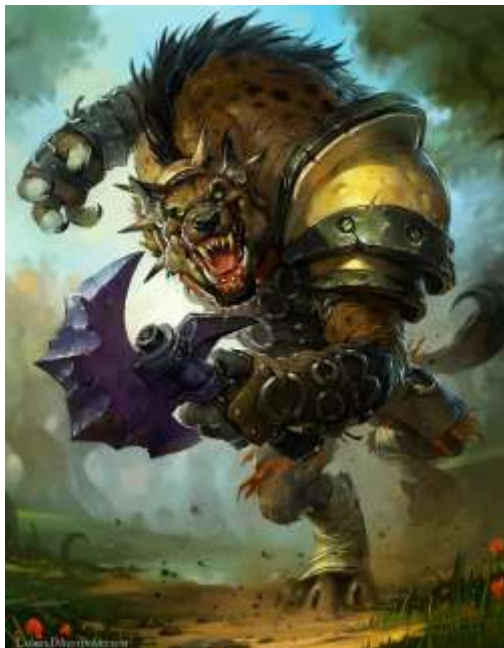
Hogger off to kill yet another n00b

He makes the list because he is perhaps one of the most famous mobs in all of Warcraft, largely because he's one of the first elite mobs encountered by newer players and tended to get a number of kills. He is apparently enough of a local legend that his pants are used as a trophy in the stockades to improve morale.