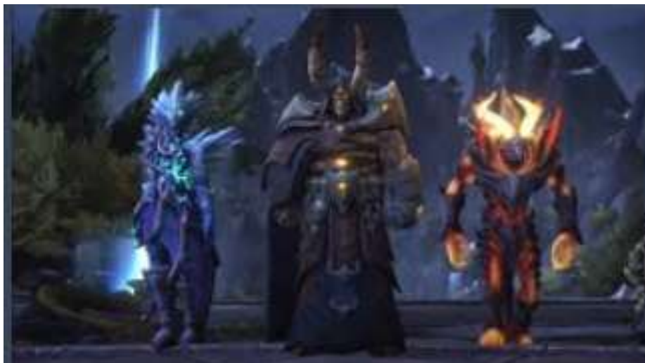
3 of the 4 incarnates in their visage forms

Raszageth – The third primal incarnate, tied to the storms. It was Raszageth's attack on the reach that kicked off the Scaleborn war, and it was that attack which got her sealed there at the reach. It wasn't until 20,000 years later when the primalist Kurog Grimtotem released her that she would go on to free the rest of the trapped primalist and then do a dead.