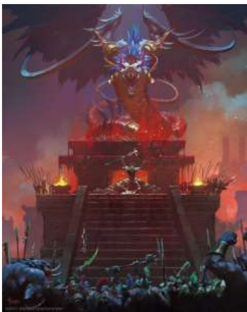
Hakkar the Soulflayer and his Atal'ai followers