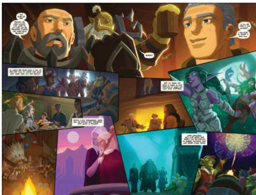
The various heroes of Azeroth celebrating Winter's Veil

Apparently here recently, a druid by the name of Daetan would like the eggs or at least one golden egg and has hired a combination of fellow druids and ducks to steal them.