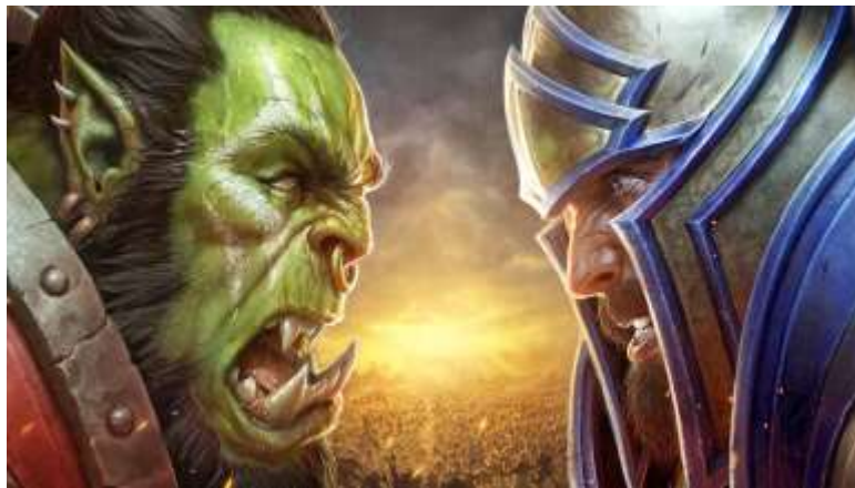
Horde vs. Alliance, the foundational principal of the series for 30 years now

Unlike the Horde, the Alliance never really operated with a singular leader, though Stormwind is arguably the capital.