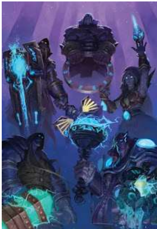
The watchers wielding the pillars of creation

Koranos – The watcher in the Dragonflight trailer who had apparently been tasked along with all the other watchers on the dragon isle, with turning the beacon of Tyrhold back on. Problematically he was at the time the only watcher left alive.