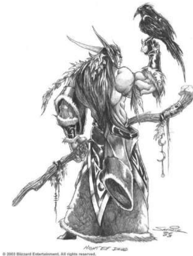
Druid Concept Art

Branch / Moon / Antler / Fin / Ashen – These are the various other druidic sects that follow the other druidic forms (Treant / Moonkin / Stag / Seal). Ashen might be a bit tougher to translate until you remember that the Feline wild god was named Ashamane (So Cat Form).