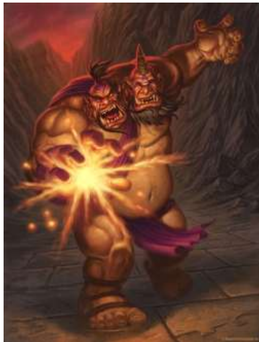
Cho'Gall being his magey self

His alternate version just ends up getting thrown in several different prisons before eventually finding himself dead at the hands of adventurers as he attempted to engage in an Orgre coup'dé ta.