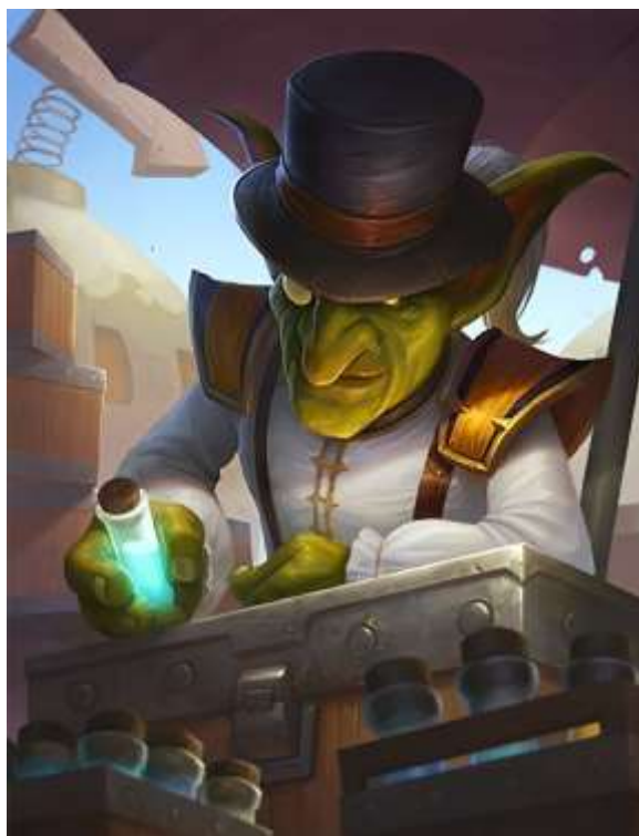
Marrin Noggenfogger of the Steamwheedle Cartel hard at work